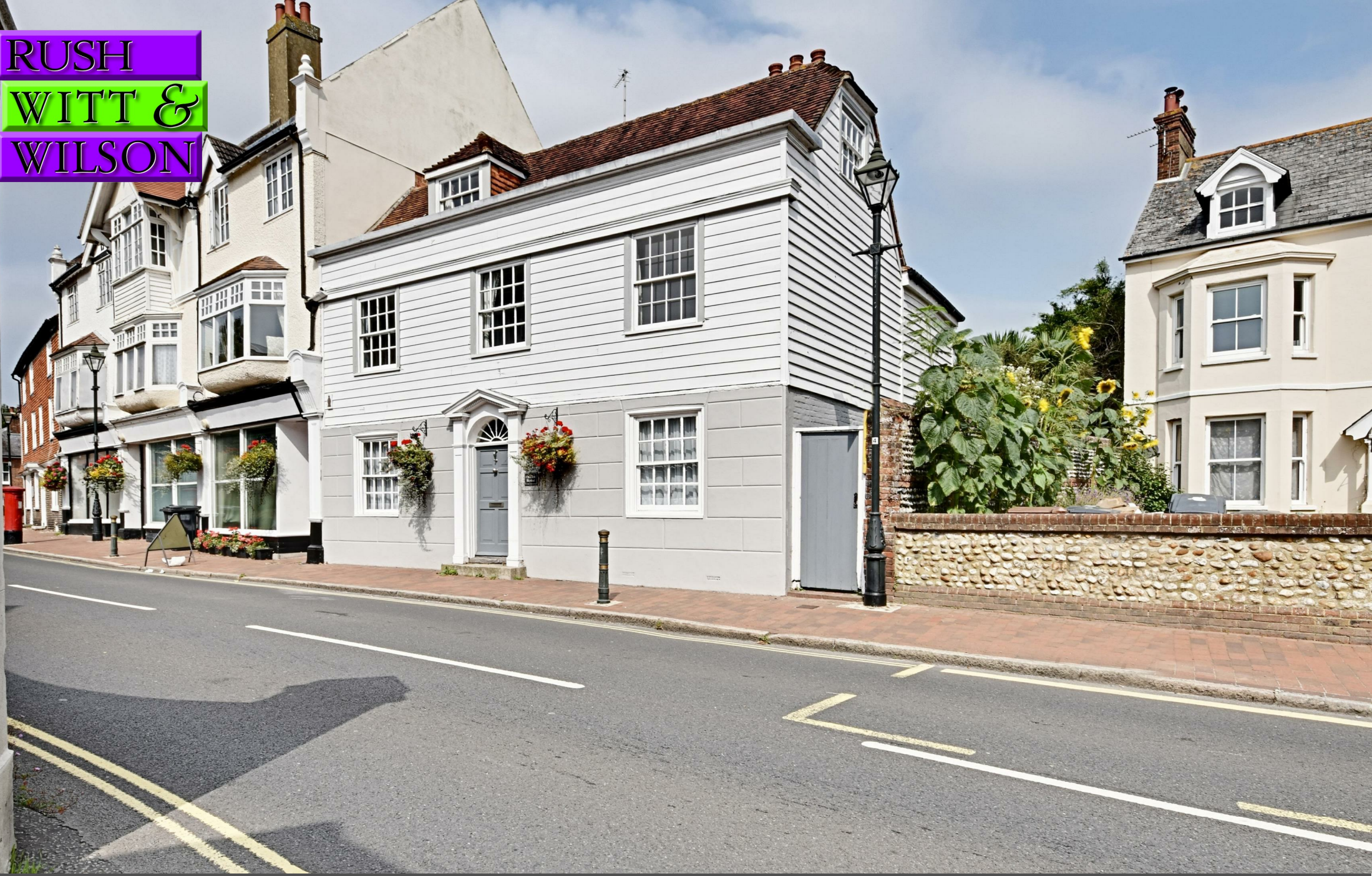
Osborn House High Street, Bexhill-On-Sea, East Sussex TN40 2HA £550,000