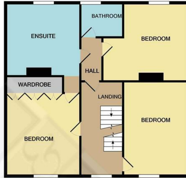
1ST FLOOR APPROX. FLOOR AREA 723 SQ.FT. (67.2 SQ.M.)